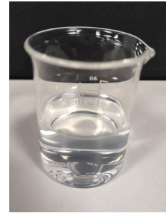
5% Elix-SOL PCG